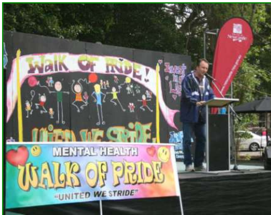
Kevin Humphries Minister for Mental Health