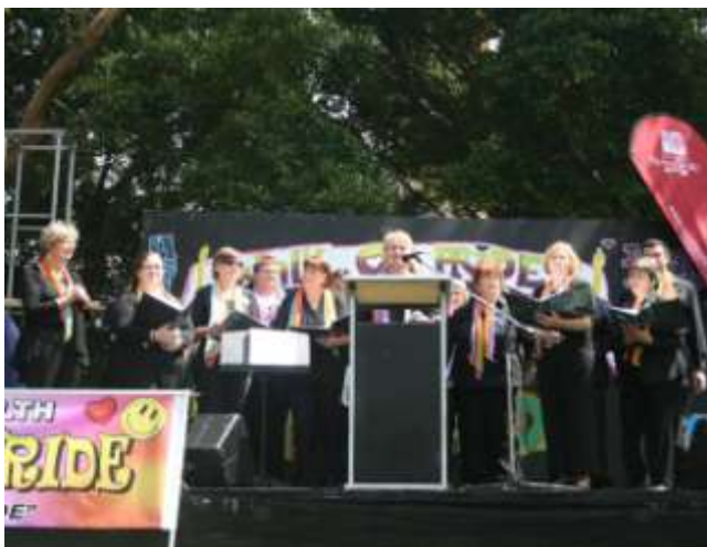
Under Construction Consumer Choir