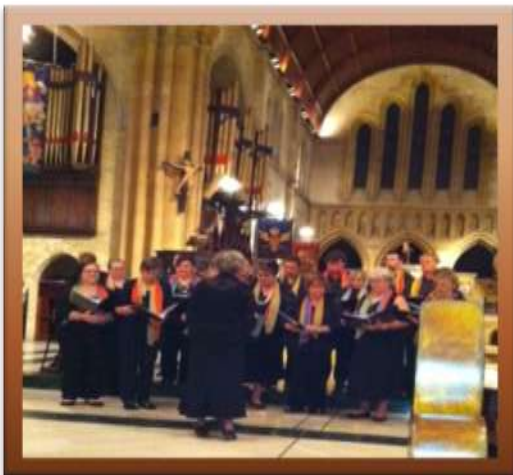
23 October 'Candlelight Vigil' Christ Church Cathedral 'Under Construction' Choir